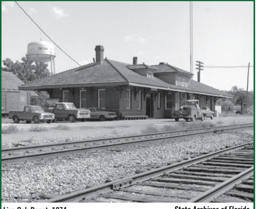
Live Oak Depot, 1974

The Sunset Limited Line was a passenger rail service from New Orleans to Jacksonville for many years until Hurricane Katrina damaged extensive portions of the rail in 2005 ending the service. Now, Amtrak and the Southern Rail Commission are resuming this route and have secured several stops. Live Oak is not (yet) one of them.